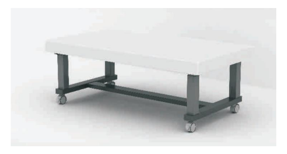
Zhengzhou Fenghua Industrial Co., Ltd <u>Waterproof type-calligraphy and painting of ancient books restoration table</u>